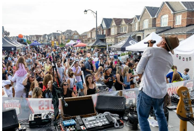
Residents at the 2024 Retro Street Party.