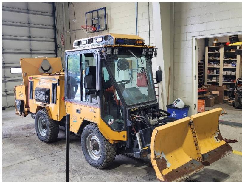
BWG's sidewalk plow at the urban yard

This is a busy time of year for the Transportation Division, the team responsible for maintaining BWG's road and sidewalk network. Every year following the Labour Day weekend, the team begins their transition into fall and winter mode – this includes fall street sweeping, removing summer equipment from dump trucks and sidewalk machines, attaching wing plows, calibrating material spreaders, and ensuring all equipment is in good running order for the season ahead.