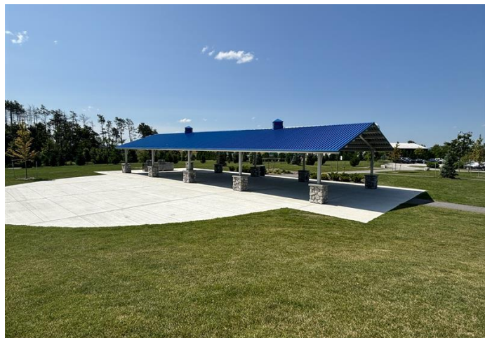
New pavillion at Henderson Park.