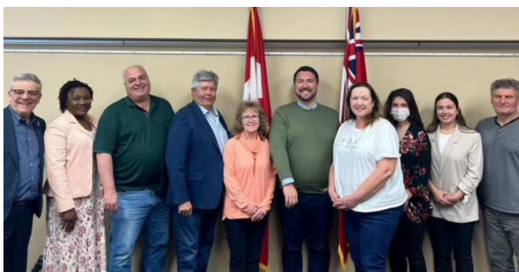
Members of the Green Initiatives Advisory Committee.

The committee has also endorsed three major advocacy initiatives. The first is the Right to Repair movement, which seeks to empower consumers by ensuring the availability of parts and