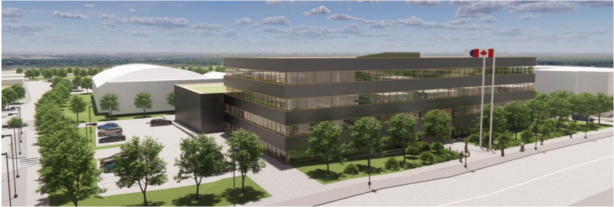
View of the Civic Centre from Simcoe Street and Edward Street.

Below are some preliminary renderings produced by Moriyama Teshima Architects.