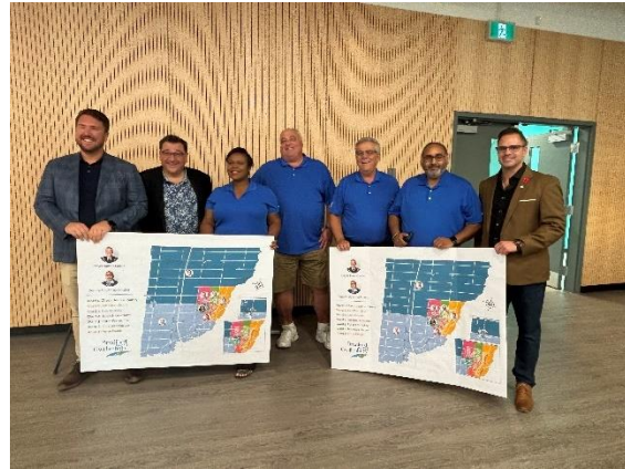
BWG Council at the Week of Welcome.

After two years of construction, the Southwest Arterial Roads (SWAR) Project is officially complete. Sideroad 10 and Line 5 between Holland Street and the Line 5 interchange was rebuilt, a new roundabout was installed at Sideroad 10 and Line 6, and Fraser Creek underwent stormwater management upgrades with the addition of two new culverts. Pedestrian access along Line 6 was also improved with a newly lit pathway. Additionally, streetlights are up and running at the curved intersection of Sideroad 10 and Line 5. The completion of these projects has greatly improved traffic flow, and pedestrian access in the area.