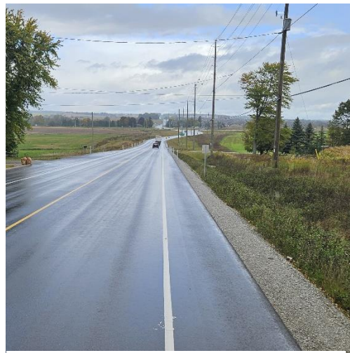
SWAR: Northbound towards Line 6

Currently in the design stage, phases 2 and 3 of the Urban Roads Project aim to further address the aging infrastructure in BWG's older neighborhoods. Key upgrades will involve enhancing the town's watermain system and repairing or replacing identified storm and sanitary sewers. A review of the street lighting system will also be conducted to ensure adequate illumination in all areas.