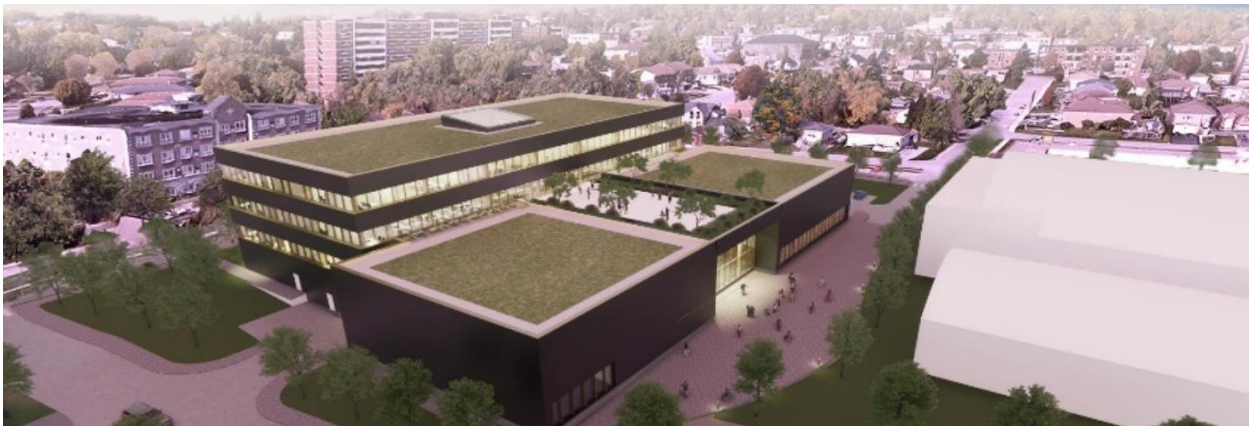
View of the Public Plaza / Rooftop Terrace