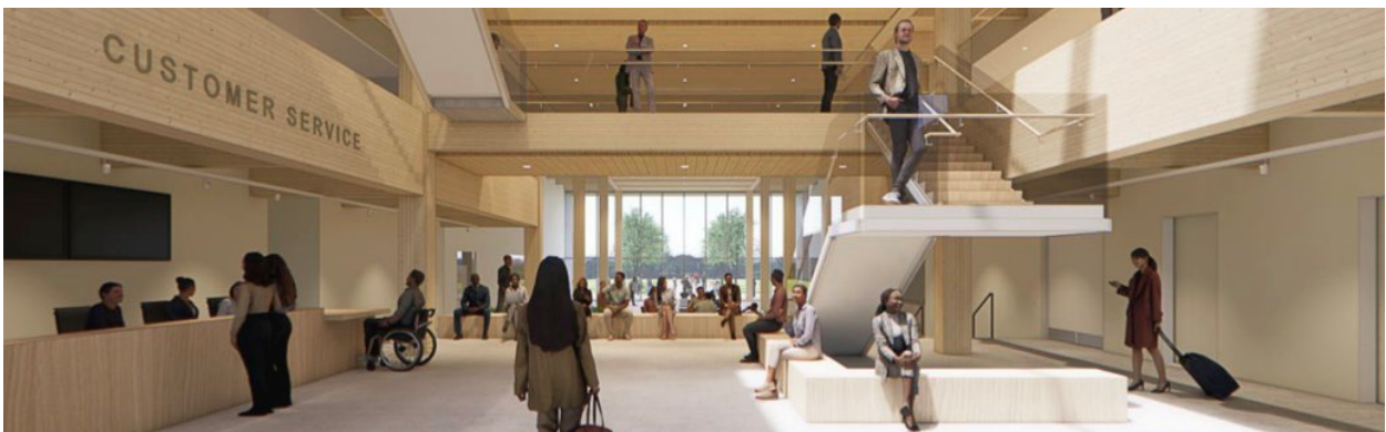
View of the Atrium inside the Civic Centre.