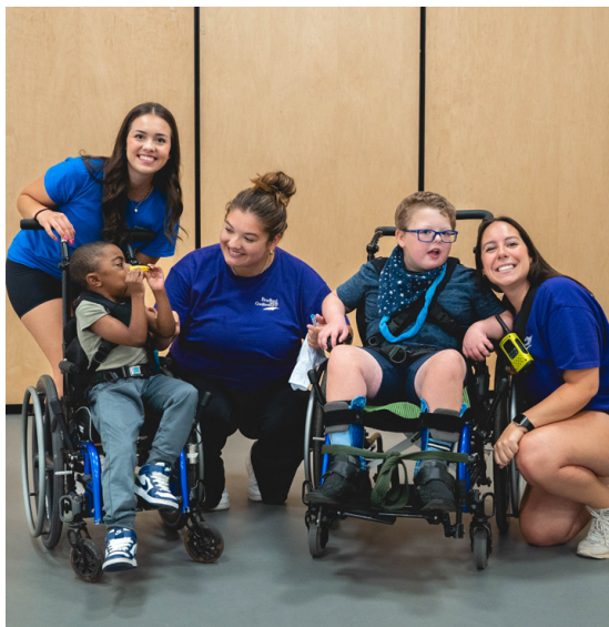
Photo of two children with special needs enjoying time with their camp councillors.

The 2025 budget emphasizes not only the development of new programs but also the creation of local job opportunities. By funding new roles in multiple departments, BWG is contributing to a vibrant and thriving workforce, particularly by supporting local youth. The inclusion of an events coordinator, seasonal park attendants, and other new positions is helping to meet the increasing demand for services while providing valuable work experience for young residents.