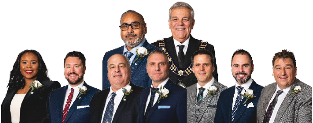
Photo of BWG Council