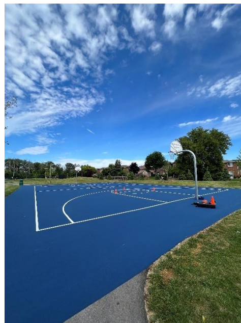
Photo of basketball court at Taylor Park

To further expand the Town's recreational offerings, BWG has introduced new roles aimed at improving service delivery and enhancing community engagement. For example, the addition of