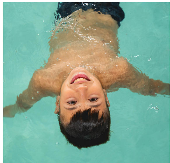
Image of a child swimming on his back in a pool and looking up at the camera.