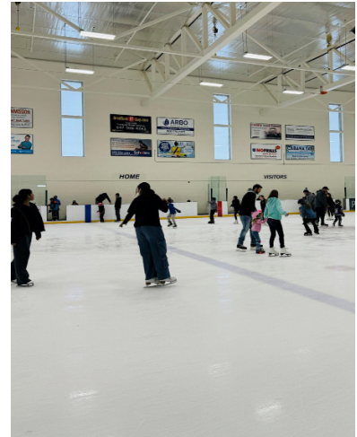
Photo of families skating at the Mayor's Levee

As we reflect on the success of the Levee, we are excited to continue this tradition for years to come. The Mayor and Council invite everyone to mark their calendars for next year's event, and we look forward to celebrating with you as we continue to build a vibrant and connected community here in BWG.