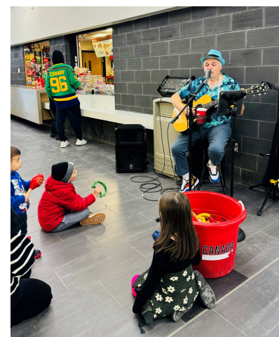
Photo of kids watching musician at the Mayor's Levee