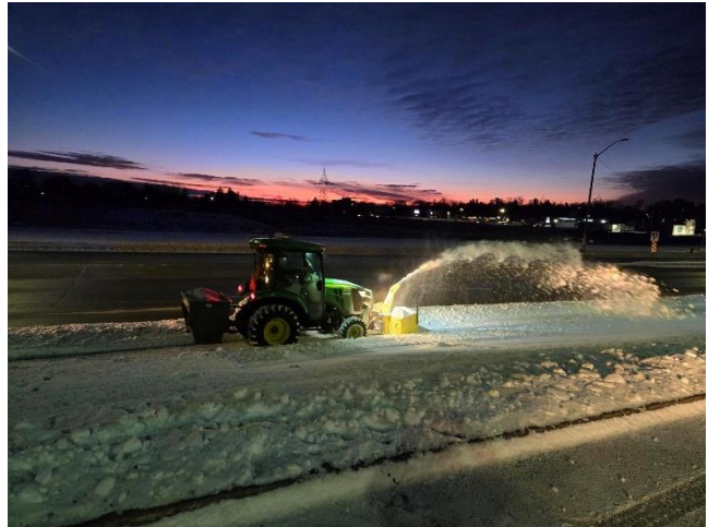
Photo of BWG employee plowing sidewalks in Town.

First, we extend our sincere thanks to our incredible staff. From the public works teams out plowing and salting roads in the dead of night to the emergency responders working around the clock, your commitment has been nothing short of heroic. You've ensured that roads stay passable, services remain operational, and that our residents are kept safe and informed. Your dedication and hard work in the face of relentless weather challenges have not gone unnoticed.