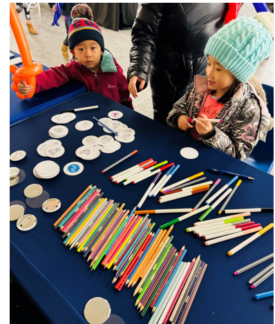
Photo of kids doing arts and crafts at the Mayor's Levee