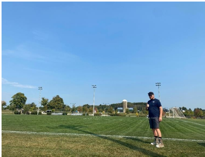
Photo of BWG Parks and Facilities employee next to one of the Town's soccer fields.

As we celebrate Employee Appreciation Day, we also look ahead with anticipation for the future. We are excited about the growth and development of our municipality, knowing that we have a team of professionals who will carry us forward. Our employees are the backbone of this community, and their work ensures that BWG remains a flourishing and connected place for all.