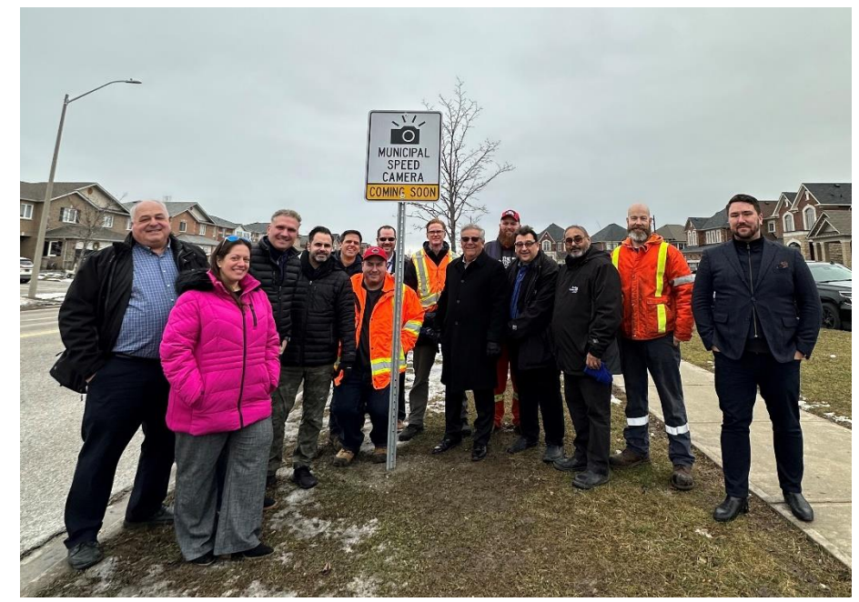
23 Council and project team at the ASE pilot project unveiling and kick-off.

"I have served on the Community and Traffic Safety Advisory Committee for three