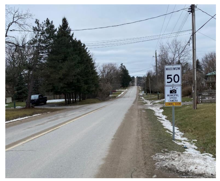
14 ASE Advanced Warning Signs at Line 7

The Automated Speed Endorsement (ASE) pilot project is another community safety initiative welcomed by Ward 3 residents. One of the four first speed camera locations announced earlier this month is in Ward 3, on Line 7, between Lallien Drive and Dixon Road. A big thank you to our Community and Traffic Safety Committee and staff who found a full turn-key solution with no upfront costs.