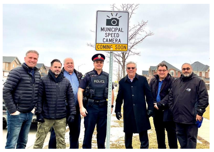
15 Council and SSPS Officer at the ASE pilot project unveiling.

One of Giordano's proudest successes stemming from the 2024 budget is the construction of Celebration Square, a 6,000m<sup>2</sup> outdoor special events space at 425 Holland Street W. Since 2022, Giordano has advocated