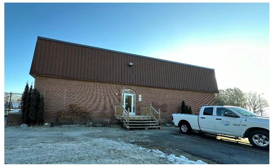
22 Exterior of Lions Park building

The Lions Park building was originally built in 1976, along with the former outdoor pool. Over nearly 50 years, the building has served our community as a meeting place, the original home of BWG's Recreational team, and pool change room. Since the closure of the outdoor pool in 2012, the building has been used exclusively to host