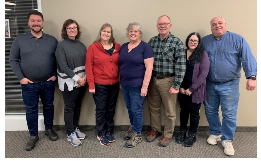
19 Members of the Heritage Advisory Committee

Recent changes to the Ontario Heritage Act, through Bill 23, meant that 386 listed properties in BWG had to be evaluated by the Committee to determine which properties should be reviewed for possible designation. The Town