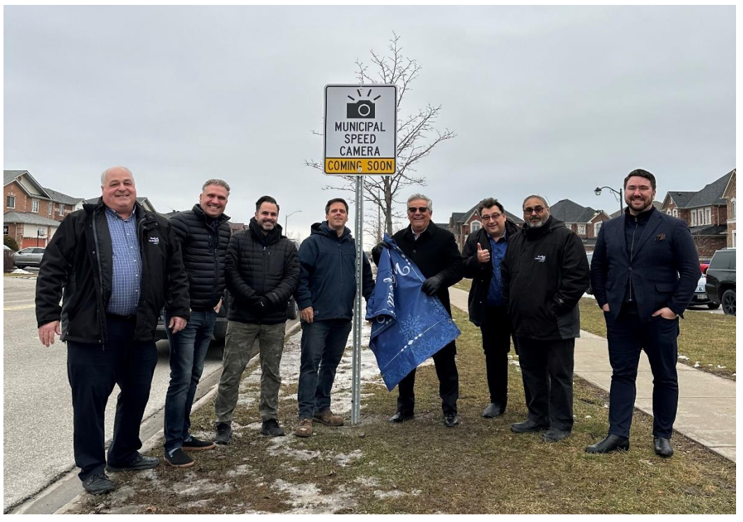
16 Council at the ASE pilot project unveiling.

Council's top strategic priority is to improve community safety and traffic congestion and the 2024 Budget has committed several investments in these