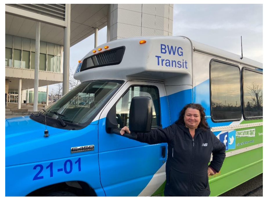
24 BWG Transit Driver

During their shift, BWG's transit drivers are responsible for checking fares, offering directions, special stop requests, maintaining schedule, and more — all while safely maneuvering an extra-large vehicle through