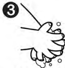
BACK OF HANDS