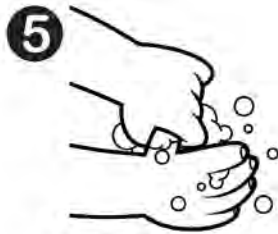
BASE OF THUMBS